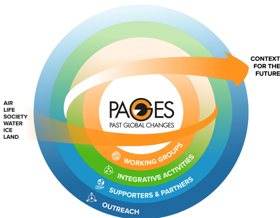
Figure 3: PAGES' proposed new science diagram (2021-). Concentric circles represent the building blocks of PAGES, which at its core is composed of working groups and integrative activities within PAGES' scope. Their research supports partner programs, informs strategies for sustainability, and provides outreach opportunities. The arrow represents the integration of information and learning that propels the paleosciences forwards and provides context for future projections.

PAGES will continue to be community-driven, with the support of its lean, efficient, and productive International Project Office. This includes even more global collection, dissemination, and synthesis across spatial and temporal scales, for phenomenologically meaningful regions and dimensions (e.g. patterns within and across elements in Fig. 3) by means of Open Science Meetings 2 and clustered meetings, in which multiple working groups convene to consider shared interests and opportunities, such as the Topical Science Meetings. 3 Although we acknowledge that personal contacts are at the heart of international science, we anticipate that meetings will become more and more internet-enabled, and virtual, to reduce their carbon footprint. This will enhance the goals of building a community, but also improve accessibility, which is especially important for an increasingly global PAGES.