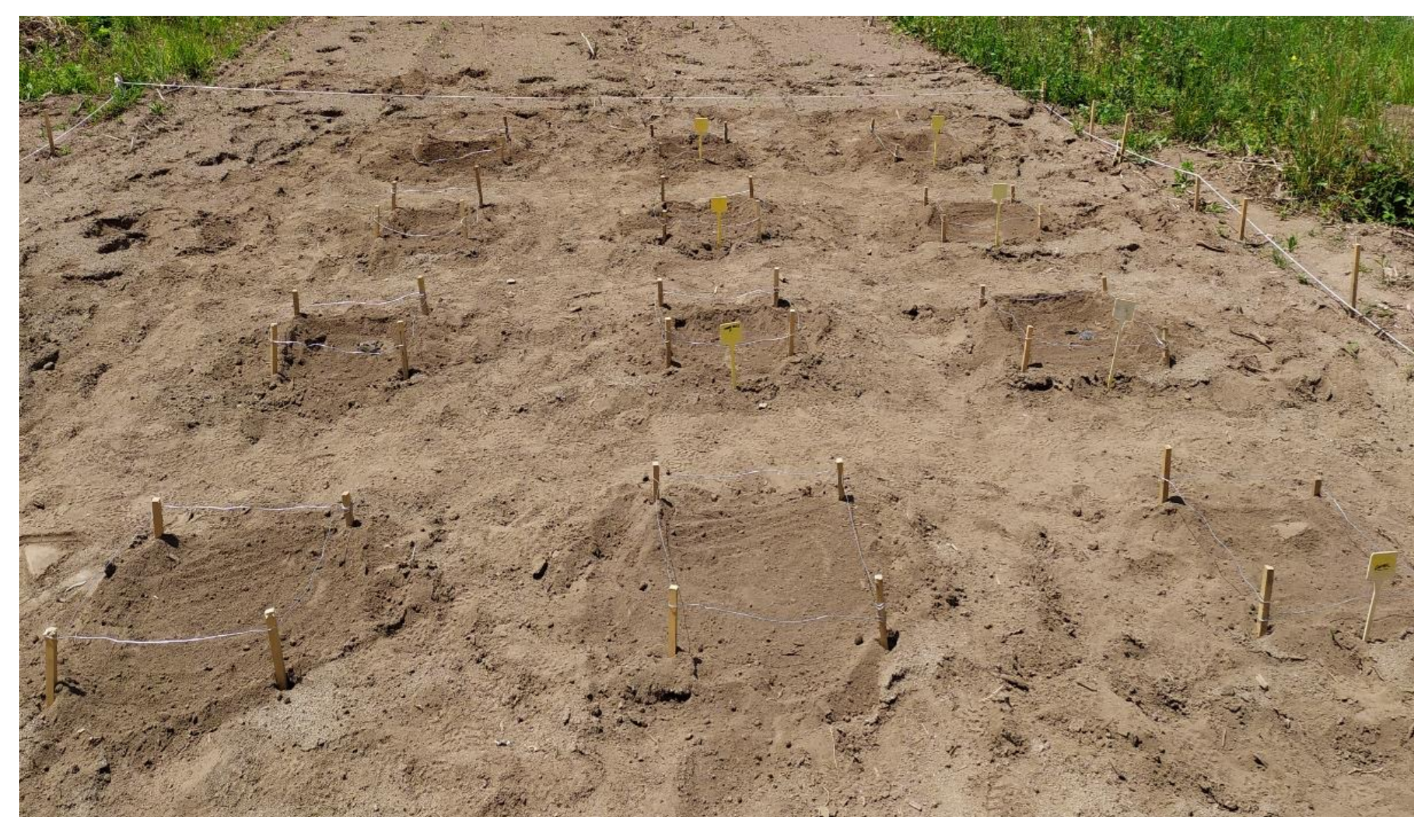
Fig 1 – Experimental field