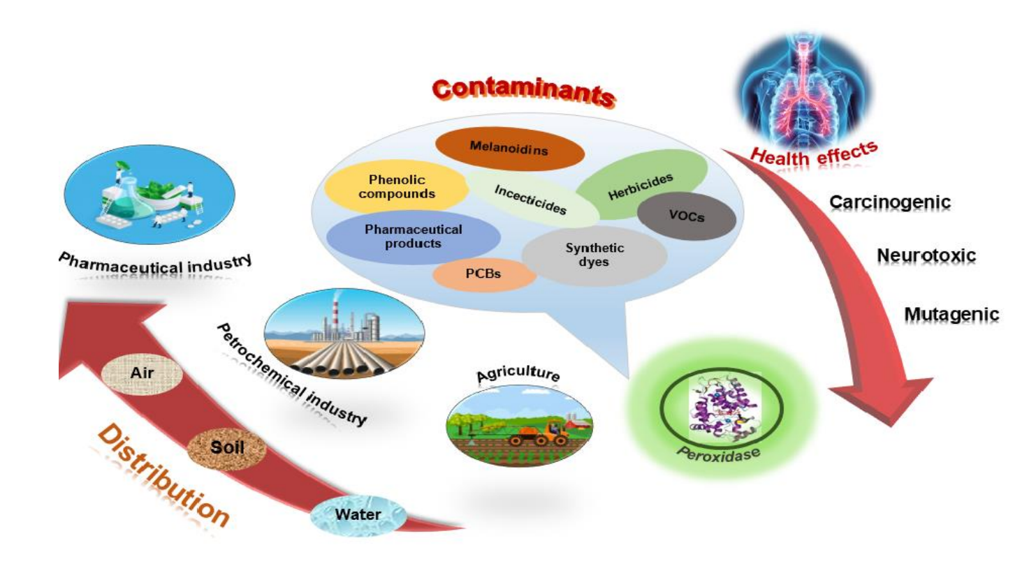
Fig. 1. Contaminants that can be treated by peroxidases, their distribution, source and the consequences related to their release into nature.