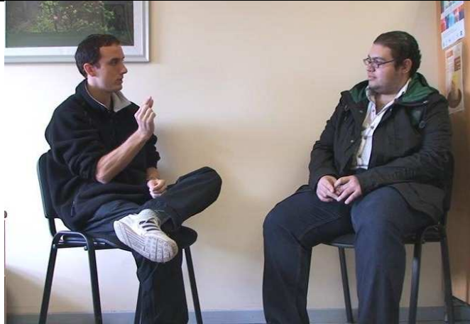
Example 18a : pour avoir des petits euh des petits morceaux [To get some small hum some small pieces]