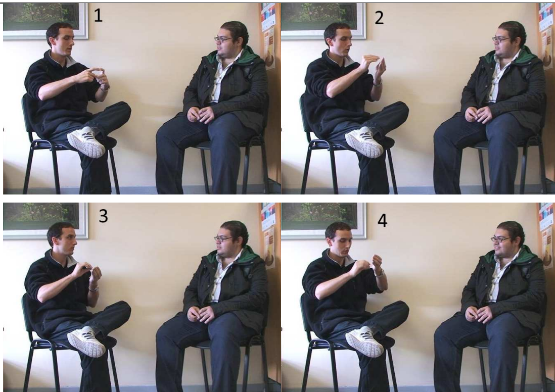
Example 18b : si j'ai un un morceau (picture 1) de fromage ouais (390ms) 6 et je le frotte (picture 2) (1340ms) ouais (1630ms) et il y a des petits (picture 3) morceaux de fromage (picture 4)

[if I have a a piece (picture 1) of cheese yeah and I rub it (picture 2) yeah and there are little (picture 3) pieces of cheese (picture 4)]