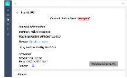
Figure 2. Example of a bed assignment display

This platform must be completed to take into account the management of the automation of downstream service bed allocation, and then present a complete decision support tool to emergency physicians. In this context, the ABAI is developed. It aims to schedule patients according to a predefined order of priority using list algorithm. The ABAI integrates the IoT-Beacons aspect and allows to create an automation bed allocation process. The originality of this algorithm is its capacity to adapt to dynamic hospital situations (overcrowding and normal situation). For example, in overcrowding situations the ABAI allows the assignment of patients to the inappropriate services in order to continue their care pathway, and then improve de AED situation. In the ABAI, every patient p has an individual score s_p that reflects its need to be assigned. The s_p is calculated using equation 2.