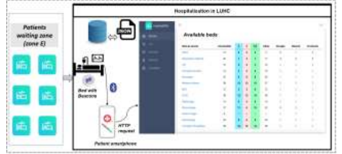
Figure 1. Architecture of IWPB platform

addition, this mobile application notifies the IWPB about the real availability of beds, since a patient UUID disconnected from the LUHC Internet system means that the bed that was occupied by that patient is empty.