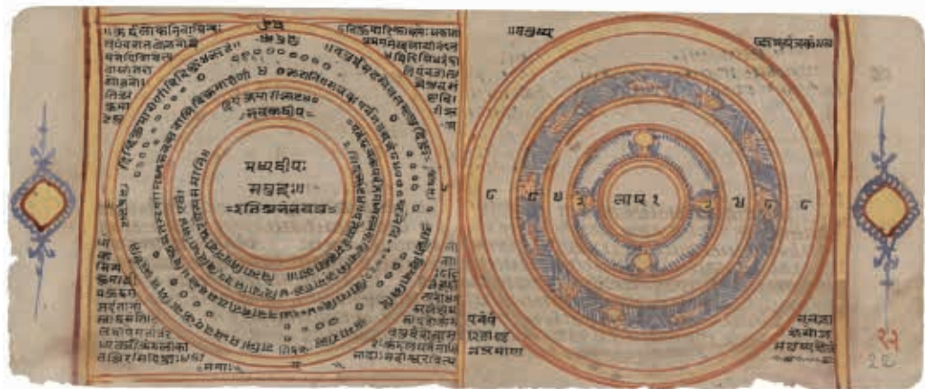
FP 4450, fol. 8r (Cat. No. 62) Laghuṣeṭrasamāsa , Uttarakuru and Devakuru on each side of Mount Meru.