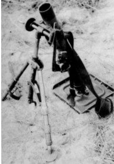
Fig. 3: The M19 Mortar was an American 60 mm mortar developed in 1942 from the Mortar M1 during the Second World War. The M19 Mortar fired a M49A4 high explosive round to a minimum range of 45 meters and a maximum range of 1814 meters with a rate of fire of 8 rounds per minute, or 18 rounds per minute for short periods.

we were shipped out and I found myself assigned to "basic training" in Georgia, a southern state where I spent about 12 weeks learning how to become a soldier. I was in the infantry and ended up being a 60 mm mortar gunner (see Fig. 3).