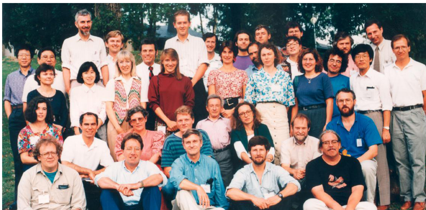
Figure 1: Participants at the PMIP workshop in Collonges-la-Rouge, France. Many are still involved in the PMIP community, though some are looking a lot older!