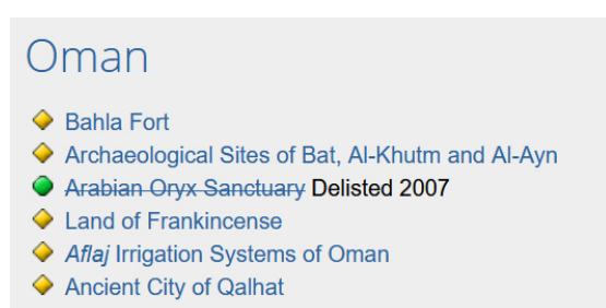
Figure 5: screenshot of WH properties registered for the State party of Oman, https://whc.unesco.org/en/list/ , accessed 18/08/2020

Reactive monitoring is meant to prevent an impending listing as World Heritage in Danger (WHD) 26 . A WHD listing functions as an alarm bell before the property is removed from the WH List. The WH Committee has made such decision three times. In 2007, the Arabian Oryx Sanctuary was removed from the WH List due to a decline in the wild Arabian Oryx population within the property's borders 27 . In 2009, the Dresden Elbe Valley was removed from the WH List following the construction of a road bridge across the property, which damaged the Outstanding Universal Value of the landscape 28 . In 2021, the Maritime Mercantile City of Liverpool was also removed following several modern constructions inside the WH site 29 . To highlight the importance and visibility of such a decision, the removed site remains archived on the WH web site (see Figure 5) where all its information, including its removal from the WH List, can be consulted.