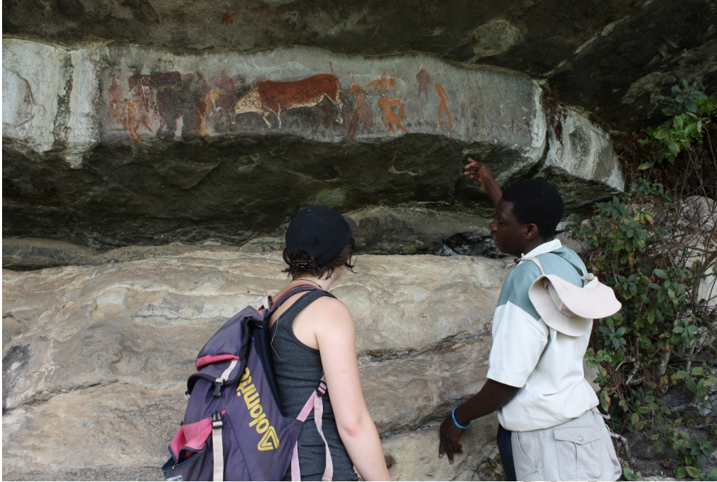
Figure 1: Game Pass Shelter, a rock art site in the nature reserve of Kamberg (South African slope of the mountain), is one of the emblematic sites of the UNESCO property, February 2011, M. Duval.