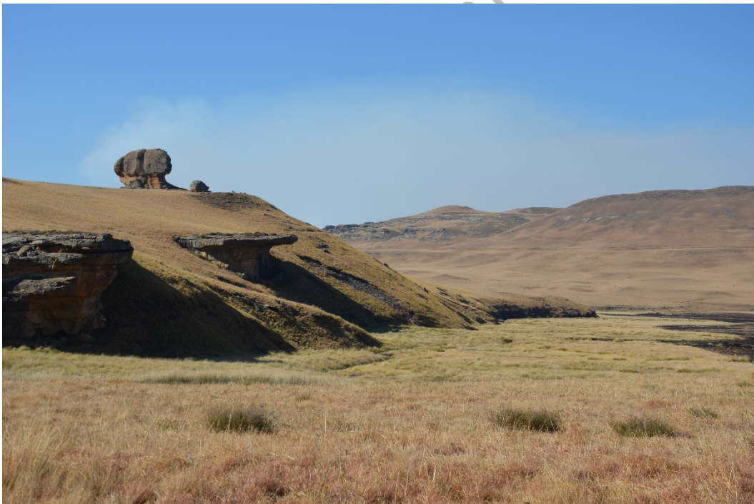
Figure 2: Sehlabathebe National Park landscape, Lesotho slope of the mountain, July 2017, M. Duval.