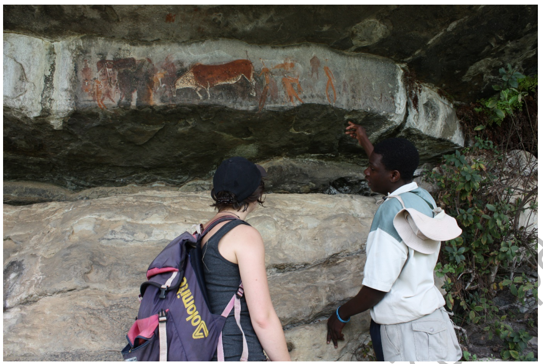
Figure 1: Game Pass Shelter, a rock art site in the nature reserve of Kamberg (South African slope of the mountain), is one of the emblematic sites of the UNESCO property, February 2011, M. Duval.