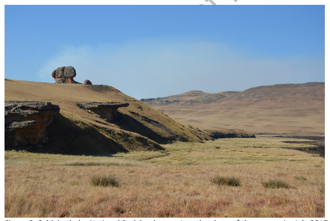
Figure 2: Sehlabathebe National Park landscape, Lesotho slope of the mountain, July 2017, M. Duval.