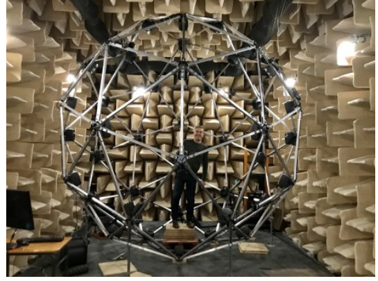
Fig. 3. Multichannel rendering system

Parametric methods process microphone array signals in the time-frequency domain and estimate spatial parameters based on sound field models. As an example, Directional Audio Coding (DirAC) [16] algorithm estimates in each frequency band the direction of the energy and the amount of diffuseness by computing the correlation between B-format channels. Omnidirectional channel of the B-format recordings is used to