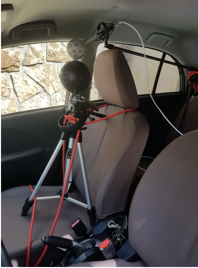
Fig. 2. Experimental setup to record 3D video and 3D audio from passenger seat viewpoint in driving situations

and consist in manually arranging microphones and loudspeakers based on heuristics. Those methods will not be further detailed here because microphone and loudspeaker layouts are interdependent. Please refer to [5] for a design methodology of such systems.