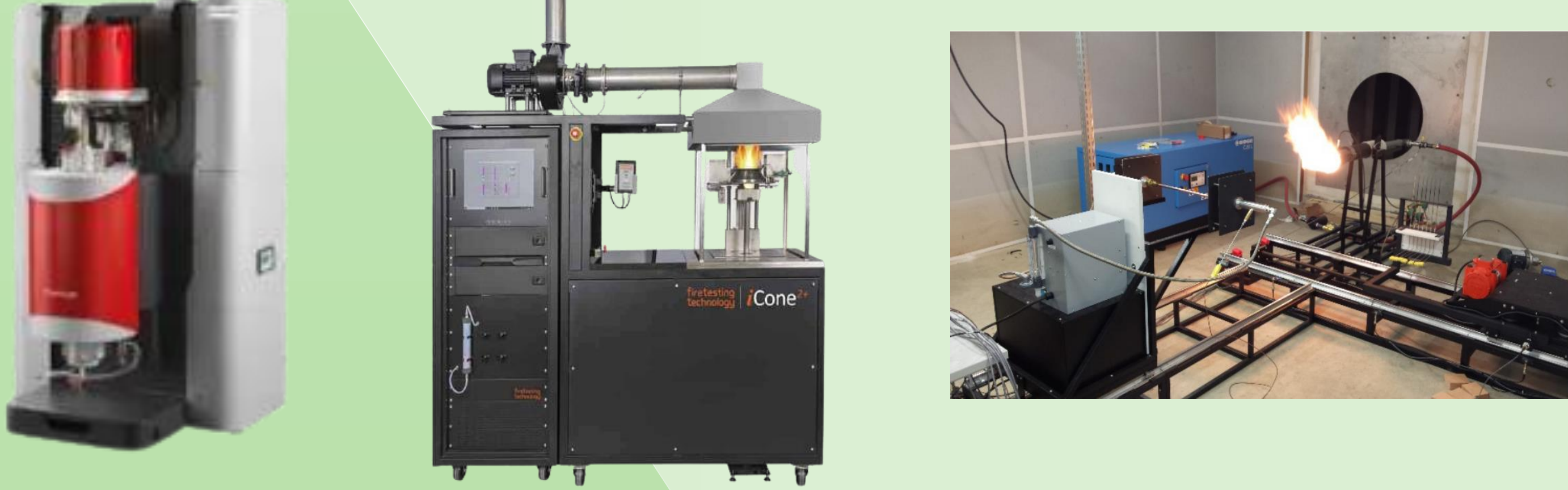
Figure 3 : Experimental setups (a) TGA (b) Cone Calorimeter (c) Vesta fire tests

The manufactured bio-based composites will be investigated at different scales (matter, product, and large)ale and big scale thermal test using TGA, Cone Calorimetre and Vesta fire test.