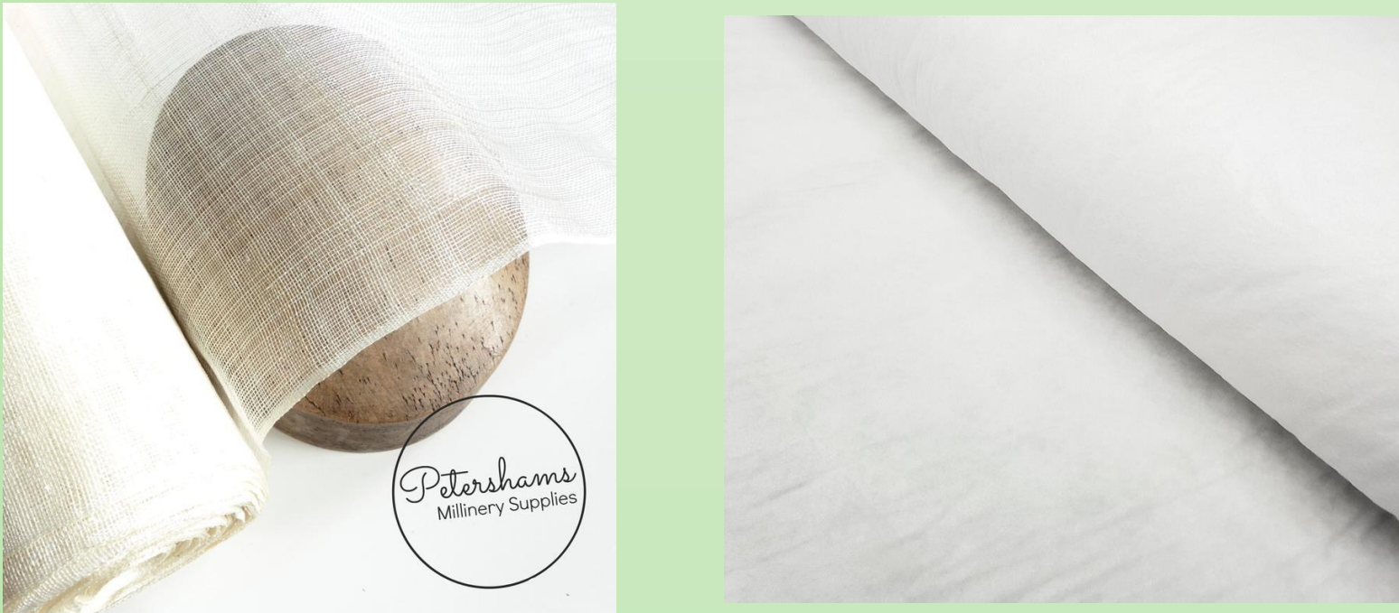
Figure 1 : Raw Materials (a) Banana leaf (b) Bamboo

First, banana leaf and bamboo natural fibres have been selected (Figure 1) to reinforce Green-poxy as resin matrix. Natural fibres have been selected by emphasizing on the research novelty based on the amount of new papers, mechanical, chemical, and thermal properties.