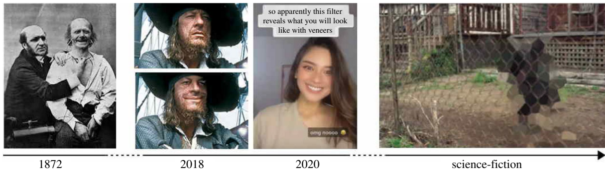
Figure 1. From Darwin to deep-learning: rapid technological advances in artificial intelligence create opportunities for real-time algorithmic modulations of facial and vocal expressions, which raises unprecedented societal and ethical questions. From left to right: (a) Original studies of human facial expressions employed electric stimulation to induce muscle contraction (Guillaume Duchenne de Boulogne, reproduced in [1]); (b) Manipulation of individual action units in still photographs using Generative Adversarial Networks (GANimation [14]); (c) Real-time smile filters in commercial video sharing platforms (Tiktok, ByteDance Ltd., Beijing, China); (d) Still from the Arkangel episode of dystopian science fiction television series Black Mirror (Endemol Shine UK Ltd., 2017) in which parents equip their children with anti-violence visual filters via a brain implant. Here, the device visually filters out a dog aggressively barking at the child, directly in the child's mind. (Online version in colour.)

difficult to trust whether the smiles, laughs and frowns of our conversation partners are genuine or algorithmically modulated (figure 1c).