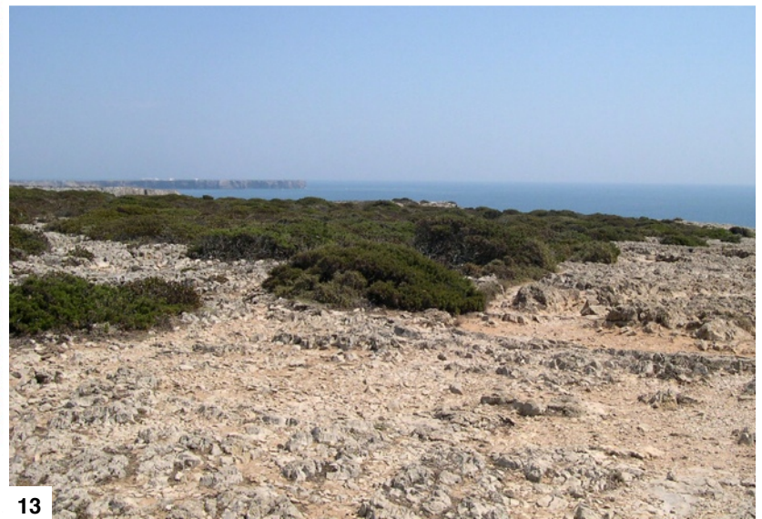
Fig. 11. Map of Portugal and Western Spain showing the distribution of the known Buthus species present in the area, with surrounded symbols showing the type locality in each species.