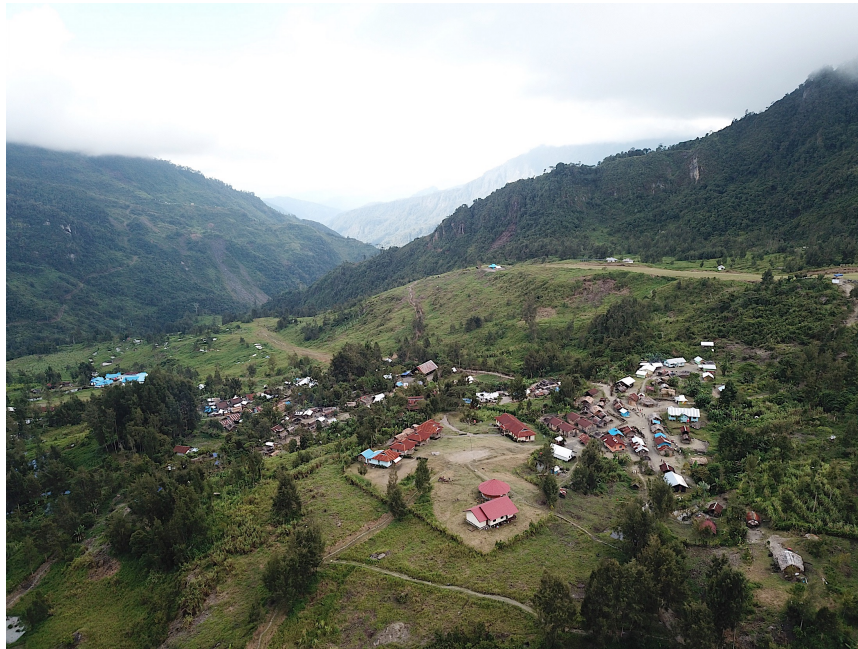
Figure 6. Drone photo by Leo Tarfik from the Eijkman Institute of the Eipomek village (Star Mountains Regency) with its red roofed roun Id cultural center and adjacent rectangular guesthouse in the foreground.

regain cultural identity. “A tree without roots will die”, the Eipo say. They have become aware that their history is precious and should not disappear completely.