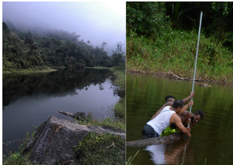
Figure 3. View of the Lake Doumi Kwen (left) near Eipomek (Star Mountains Regency) located at an elevation of 2055 m at S 4°28'24.144'' E 140°0'25.093' with a circumference ca. 560 m and of the sampling of a sediment core for palaeoenvironmental research by a member of the Balai Arkeologi Papua and two local Eipo men.