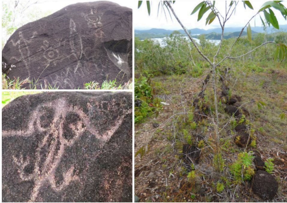
Figure 5. View of some of the petroglyphs (left) and stone alignments (right) at the site of Tutari on the northern shore of the Sentani Lake (Doyo Lama, Jayapura Regency).