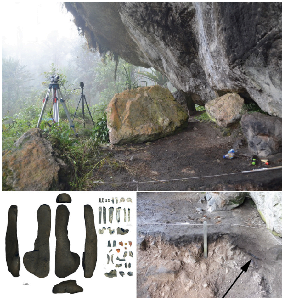
Figure 2. Emok Tum Rockshelter (Serambakon, Oksibil, Star Mountains Regency). Top: View towards the West from the excavated area (of which the western limit is seen in the foreground). An optical theodolite and a laser level allowed situating the excavated area in relation to a point 0 corresponding to the top of the highest boulder visible in the very back. Bottom left: Six aspects of a manuport stone found in situ in the North-West corner of the test pit and examples of burned small bone fragments and ochre pieces found in the sieve after wet sieving sediments from the dark ashy layer with a 2 mm mesh. Bottom right: North-West corner of the test pit with the arrow indicating the location where the manuport stone was found and the charcoal on which a date of 2\,140 \pm 30 ^{14}\text{C} years before present (Beta-518106) was sampled in the area just below the stone at the bottom of the circa 15 cm black ashy layer.

an Austronesian population and was dated with a ^{14}\text{C} date on charcoal to 1\,635 \pm 30 ^{14}\text{C} ybp (Lyon-17269/SacA-59583). This date is very recent as compared to other Lapita sites in Melanesia and more recent than the ones obtained from pottery sites on the nearby north coast east of the international border with Papua New Guinea (PNG) near Vanimo (Gorecki et al. 1991, Beaumont et al. 2019). In sum, in order to reach a better understanding of the geographical and chronological history of the earliest and subsequent prehistoric population dynamics in the western half of NG, more archaeological prospections to find promising long stratigraphies with datable archaeological remains are required. Pleistocene occupations dating back to at least 30 000 ybp for the western Papuan Highlands are suggested by dates obtained on micro-charcoal attributed to fire made by humans and retrieved from sediment cores from the Baliem Valley in the Wamena area (Hope 1998, Hope and Haberle 2005).