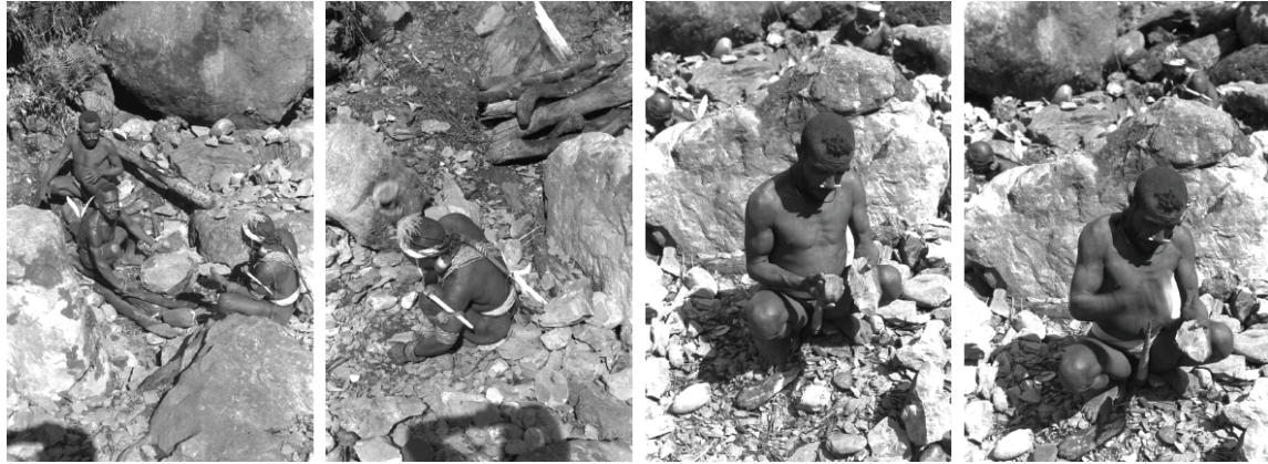
Figure 4. Photos taken by Wulf Schiefenhövel in 1975 of Una stone tool makers at the Andesit stone quarry deep down below Langda on the bank of the Feime/Heime River. The knappers worked with their bare hands, their bodies naked except the classic penis gourd. Their skills were so advanced that they did not need any protective devices. It was impressive to see a master knapper select a large raw stone (a blank) to gradually and very swiftly turn it into a perfect adze preform by applying exact, forceful, but controlled strikes with the percussion tool, breaking off too sharp edges with lighter force or by grinding movements. The fourth finger of the left hand (in the usual case that the knapper was a right hander) was placed under the stone blank and functioned as a kind of buffer, allowing just the right amount of shock to be applied to the blank