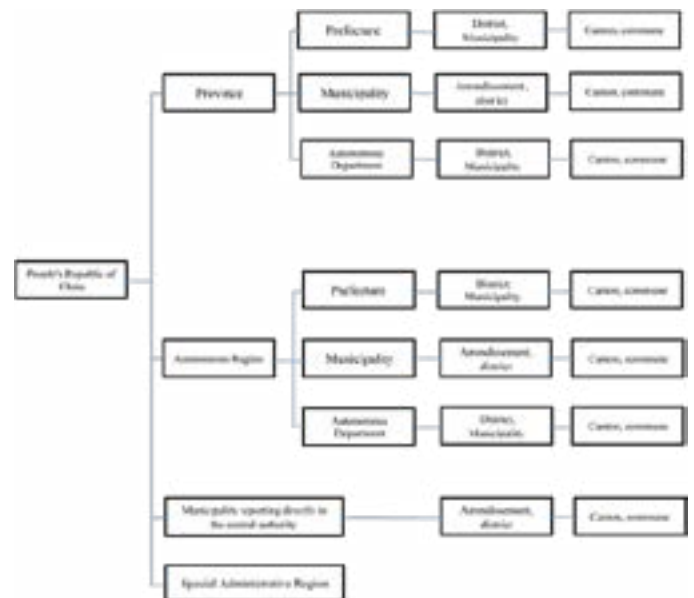
Figure 3: Administrative levels

The second structural element that must be taken into account in any analysis of tax reforms in China is the peculiarity of the administrative subdivision of the Chinese state _ a subdivision according to which any process of designing specific policies in terms of reforms or laws is fundamentally dependent on the search for consensus. This structural element also explains the progressive nature of most tax reforms in China. The Chinese state has understood one thing. It has understood that there is no point in fighting and that it is better to convince than to defeat _ because what is convinced is automatically defeated. While what is defeated, is not convinced. With a state as continental as China’s (9.6 million km²), no major reform can be undertaken without a consensus between different actors at both national and local levels [43]. Consensus, through persuasion, is the driving force behind the development of specific policies in China.