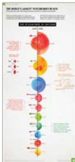
Figure 2: Top 10 countries, by DGP (PPP)

When the Chinese phenomenon agitates some more than it reassures others (Figure 2)