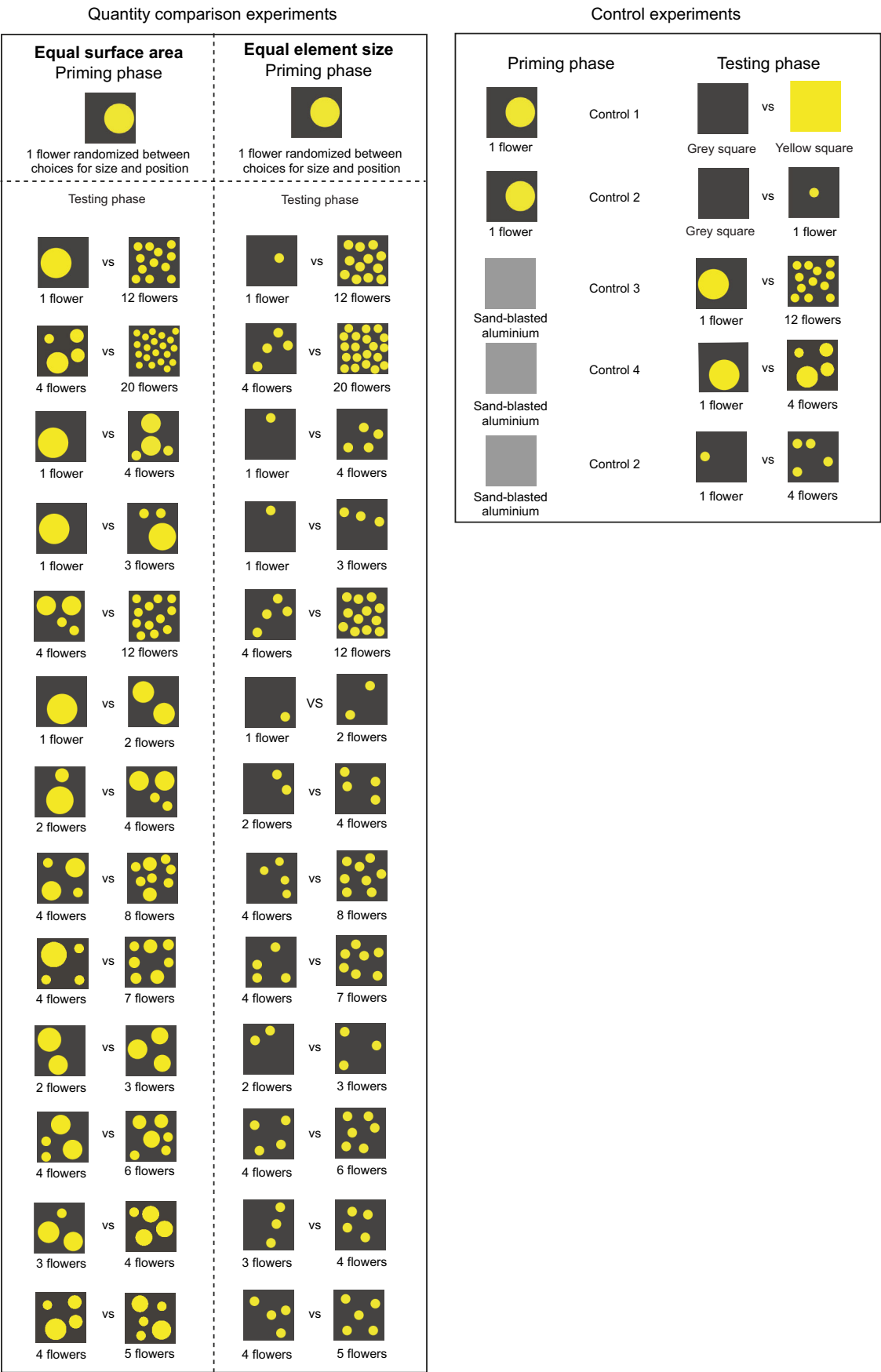
Fig. 2. Examples of the stimuli used for all 13 quantity comparisons and 5 control experiments.