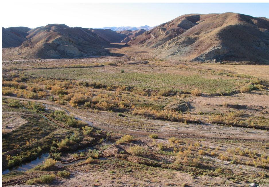
Fig. 2. The landscape of the ancient salt mine of Chehrabad, Zanjan Province, north-western Iran. A view out of the mine.

The two partly mummified specimens from Chehrabad are here compared with population samples of other small Eptesicus bats from Eurasia. This study follows the previous comparison by Benda & Reiter (2006) and is extensively complemented of new comparative material of the relevant populations, including some type specimens. For comparative morphological and morphometrical purposes we used skulls, from external dimensions we took only the forearm length (LAt). The specimens were measured in a standard way using mechanical or optical callipers. Horizontal dental dimensions were taken on cingulum margins. The examined museum comparative material is given in Appendix. We evaluated 15 craniodental dimensions in each skull (13 measurements in the skull and maxillar tooth-row, three measurements in the mandible and mandibular tooth-row; for particular dimensions see Abbreviations) plus five indices that described the skull shape. Statistical analyses were performed using the Statistica 6.0 software.