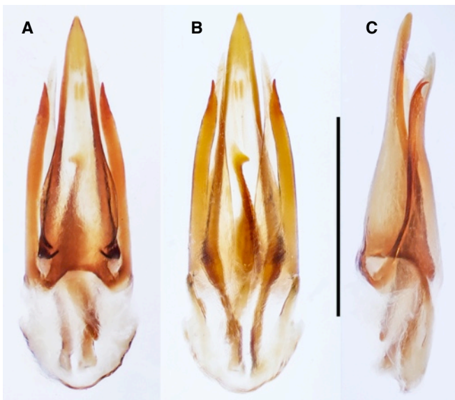
Fig. 3. Penia jiangi sp. nov., holotype, ♂, genitalia (Scale bar = 1 mm).

A) Abdominal sternite VIII and tergite VIII, ventral view. B) Abdominal tergites IX–X, dorsal view. C) Abdominal sternite IX, dorsal view.