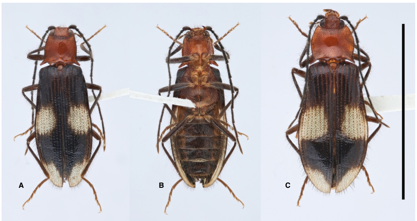
Fig. 1. Penia jiangi sp. nov., habitus. A & B) Holotype, ♂. C) Paratype, ♀. Scale bar = 10 mm.

Natural history. – This species was collected by beating the branches of the shrubs by umbrella (Ri-Xin Jiang and Bo-Yan Li, personal communications).