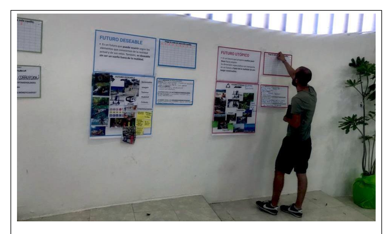
Figure 5. the workshop for the Tulum master plan: vote and discussion