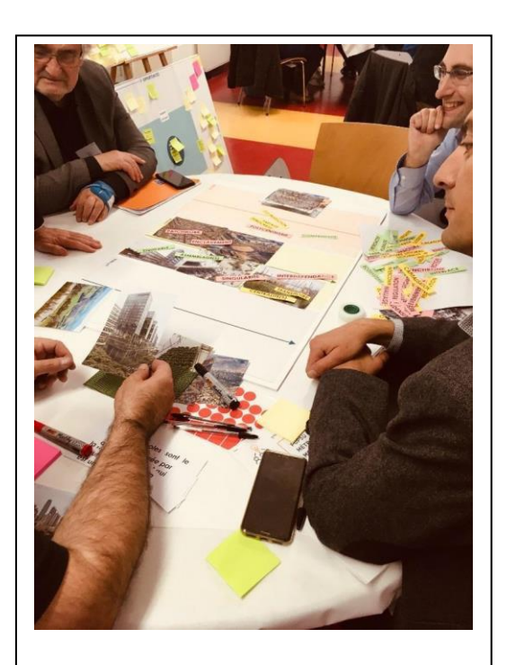
Figure 2. POPSU Montpellier Métropole coproduction workshop