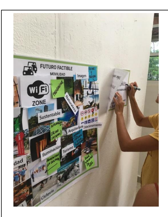
Figure 3. Workshop for the Tulum master plan: organizing a frieze of futures.