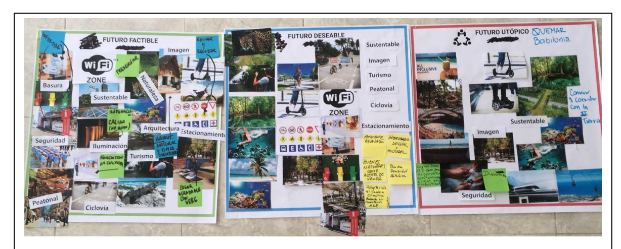
Figure 4. Workshop for the Tulum master plan: complete frieze with three futures.