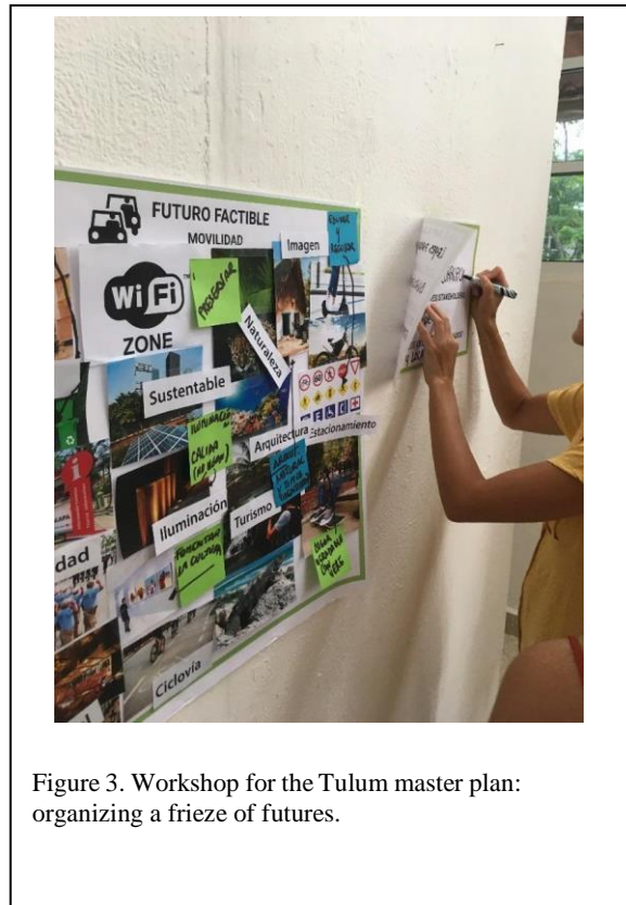
Figure 3. Workshop for the Tulum master plan: organizing a frieze of futures.