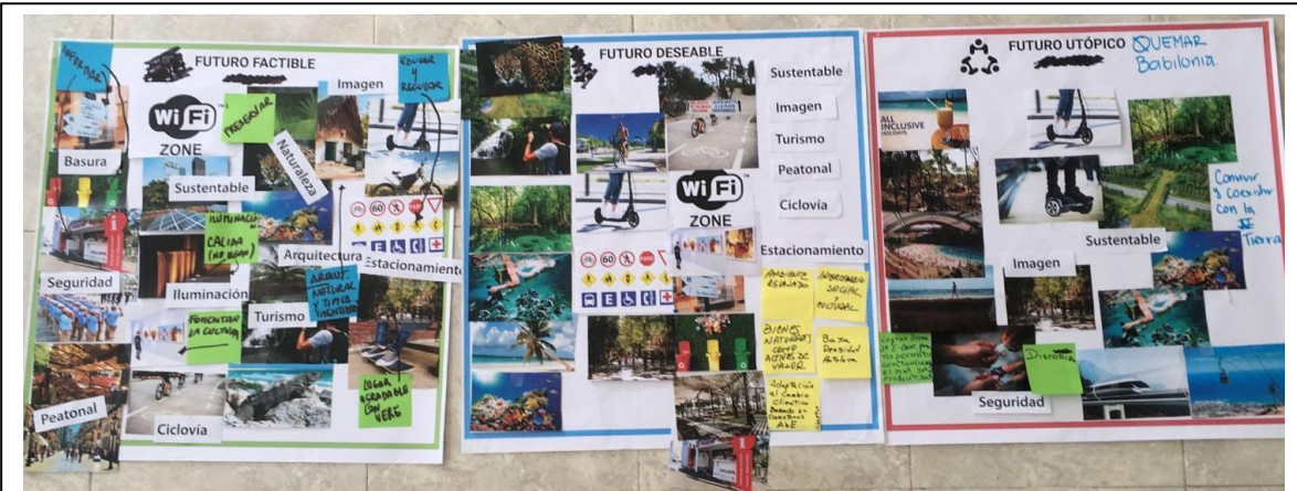
Figure 4. Workshop for the Tulum master plan: complete frieze with three futures.