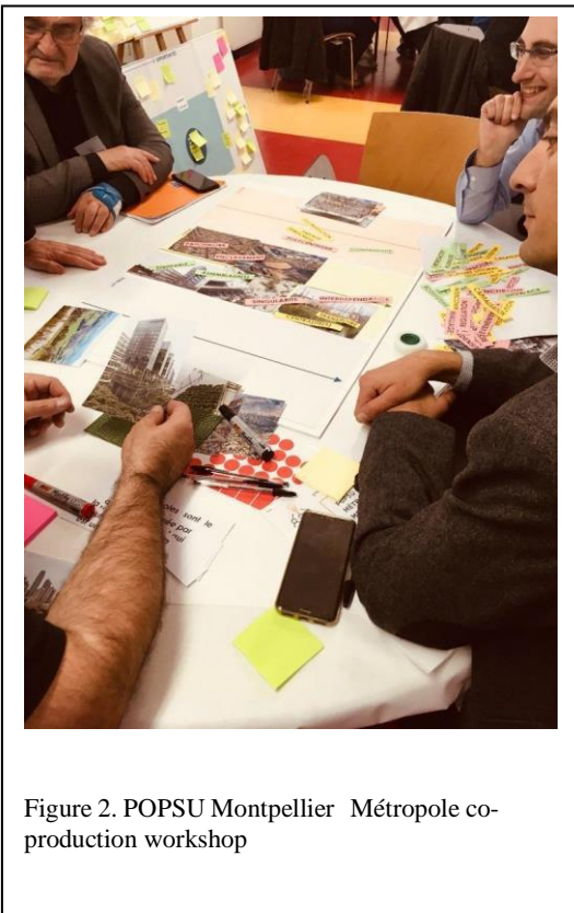
Figure 2. POPSU Montpellier Métropole co-production workshop