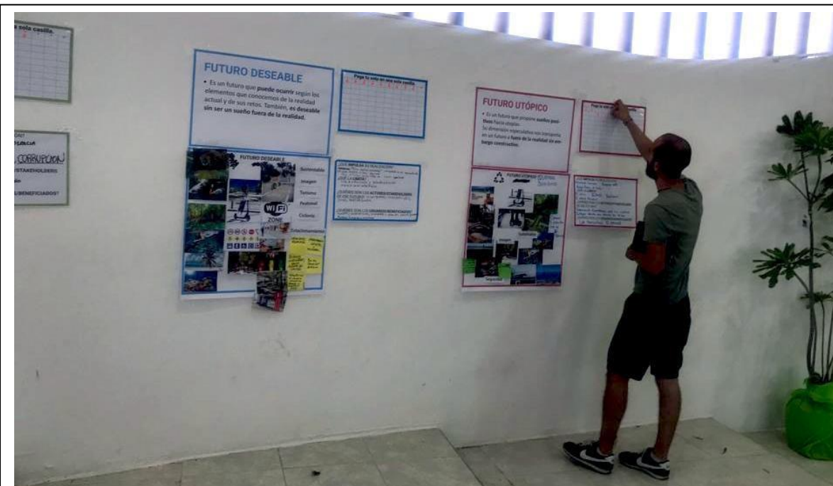
Figure 5. the workshop for the Tulum master plan: vote and discussion