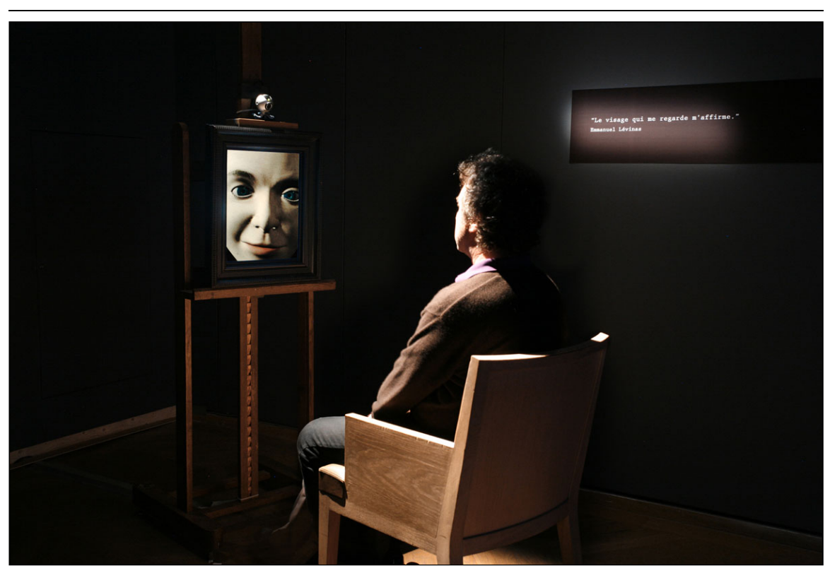
© Catherine Ikam, Louis Fleri, Oscar, 2005.

shows that the common work manages to move beyond the tension of its collective production thanks to many social fixations. By monitoring its transformations, our sociology of artistic work enables us to shed light on the theatre of operations and negotiations embodied in and executed by the work: negotiations between actors objects with respect to roles or identities in the <u>negotiated order</u><sup>14</sup> between the various social worlds in which this work is disseminated. Because of its instability and its plastic nature 15, this "boundary work" eludes the usual definitions of art and adapts to the specific needs and necessities of the different actors with whom it engages. At the same time, however, it must remain robust enough to preserve the common project and the identity of these different actors.