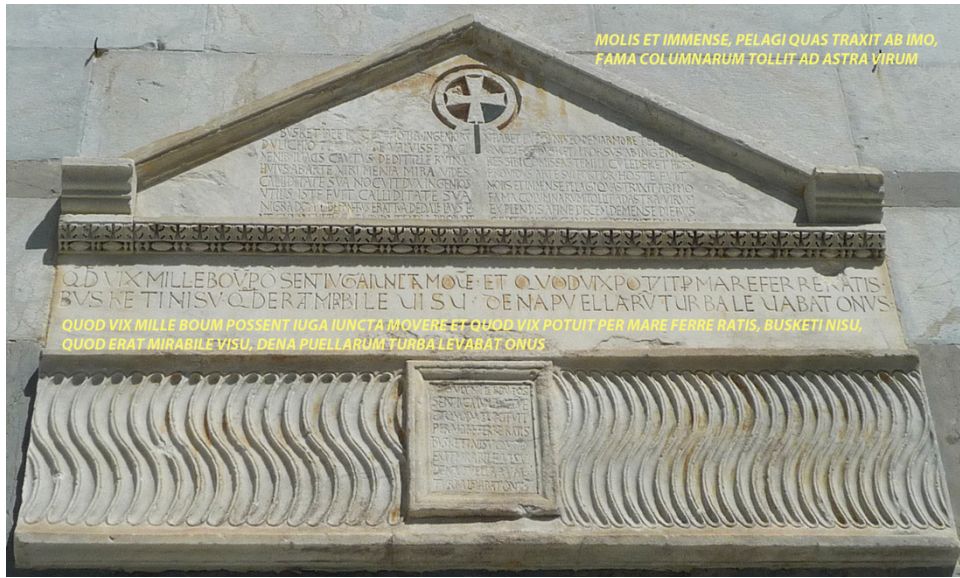
Figure 3: inscriptions in the façade of Pisa cathedral

By analogy with the case of large shafts in Pisa, the 108-cm-diameter Ainay shafts, which are by far the largest found in France, may possibly be interpreted as newly quarried shafts or unused leftovers from the antique quarry in Corsica, rather than spolia from a Roman temple as discussed in [15]. A particularity of the Ainay shafts is that they seem to be derived from two halved original columns based on their short length (about 4.3 m).