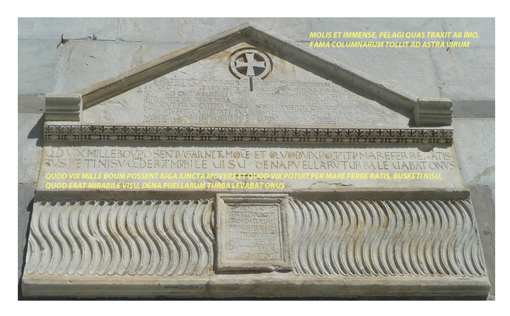
Figure 3: inscriptions in the façade of Pisa cathedral

By analogy with the case of large shafts in Pisa, the 108-cm-diameter Ainay shafts, which are by far the largest found in France, may possibly be interpreted as newly quarried shafts or unused leftovers from the antique quarry in Corsica, rather than spolia from a Roman temple as discussed in [15]. A particularity of the Ainay shafts is that they seem to be derived from two halved original columns based on their short length (about 4.3 m).