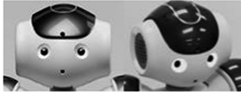
Fig. 1. Robot gaze stimuli. The left image presents the direct gaze; the right image presents the averted gaze.

cue (< vs. >)—hereafter referred to as the target—flanked by non-target stimuli corresponding either to the same directional response as the target (congruent flankers, e.g., >> > >>), or to the opposite response (incongruent flankers, e.g., << > <<). Typically, the time needed to respond is significantly greater in incongruent than congruent conditions, a well-known difference termed the flanker interference [91]. Attentional control is required to stay focus on the target so as not to be distracted by the incongruent flankers and reduce the interference as much as possible. As in the Stroop task [4, 26], the response selection/inhibition processes involved in the EFT proved sensitive to the social cues present in the environment [26]. One advantage of the EFT compared to the standard Stroop task is the absence of any semantic component which facilitates its modeling [5, 7, 8, 68].