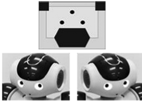
Fig. 3. Neutral stimuli (above) and averted robot gaze (bottom).

last third of trials was displaying neutral items that were designed to present roughly the same amount of visual information as the two others (Figure 3).