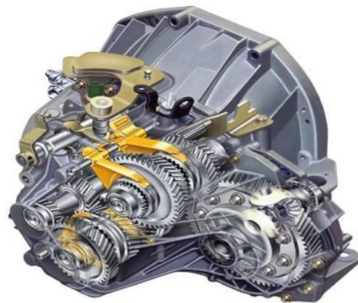
Automotive gearbox studied for rattle noise characterization.