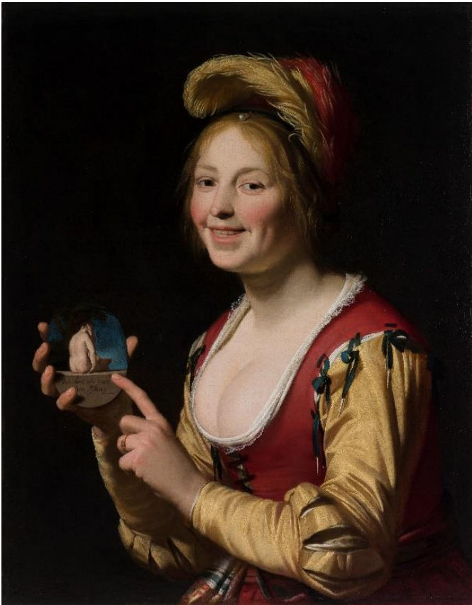
Fig. 5. Honthorst (van) G. (1625) Smiling Girl, a Courtesan, Holding an Obscene Image. Oil on canvas, 81,3 x 64,1 cm. Saint-Louis, Saint-Louis Art Museum (63:1954).

historically been portrayed through a racial and colonial perspective (Lafont, 2019; Lewis, 1996).