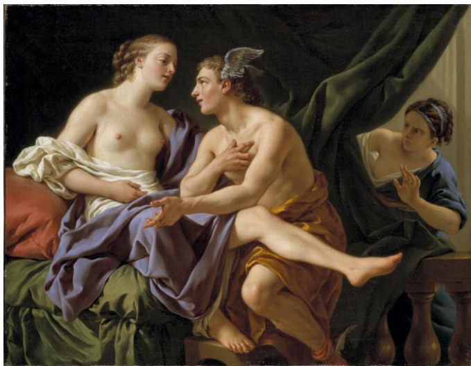
Fig. 2. Lagrenée L.-J.-F. (1767) Mercury, Herse and Aglauros . Oil on canvas, 55 x 70 cm. Stockholm, Nationalmuseum (NM 839).

The exact color of the flesh color in painting remains difficult to define. It actually corresponds to a wide spectrum of shades, often clearer on representations of women (Frost, 2010), more or less reddish depending on the emotional state of the character (embarrassment, anger, etc.). Several treatises on medieval pictorial