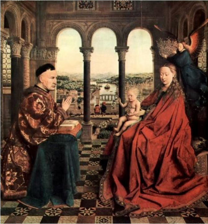
Fig. 1. Van Eyck J. (1435) Madonna of Chancellor Rolin . Oil on panel, 66 x 62 cm. Paris, Musée du Louvre (1271).