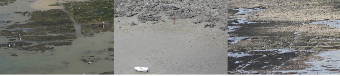
Figure 2: Images from shellfish dataset with 15, 3 and 26 shellfish gatherers