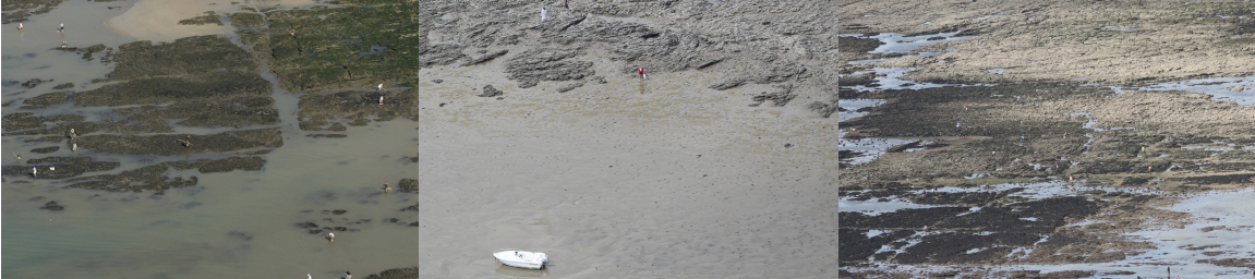
Figure 2: Images from shellfish dataset with 15, 3 and 26 shellfish gatherers