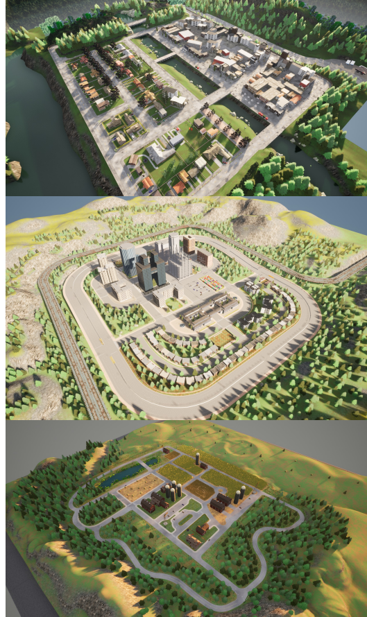
Fig. 1. Examples of maps from the CARLA Simulator used to create our synthetic dataset. Respectively from top to bottom: city (Town01), highway (Town05) and farm (Town07).

Let's define a frame as a complete revolution of the data coming from the LiDAR. During the revolution, the LiDAR