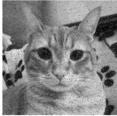
Without optimal mapping PSNR=20.39 dB