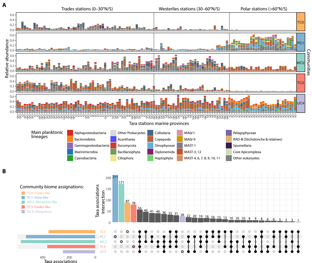
Fig. 2. Biome-specific communities and associations emerge from the plankton interactome. (A) The GPI can be decomposed into five communities that are preferentially observed in specific marine biomes: Communities TC0 and TC3 are Trades-like, community WC2 is Westerlies-like, community PC1 is Polar-like, and community UC4 is ubiquitous. Distinct main plankton lineage compositions are observed in each community along the latitudinal axis (stations are ordered by absolute latitude), disrespect of the ocean region. SPO, South Pacific Ocean; NPO, North Pacific Ocean; SAO, South Atlantic Ocean; NAO, North Atlantic Ocean; IO, Indian Ocean; RS, Red Sea; MS, Mediterranean Sea; SO, Southern Ocean; AO, Arctic Ocean. (B) Most plankton associations between main plankton lineages are community-specific, with communities WC2 (Westerlies-like) and PC1 (Polar-like) displaying the highest number of discriminant associations, while community UC4 displays fewer ubiquitous associations. Shared associations between communities are indicated with black-filled circles and connecting lines.

All GPI communities (with the exception of the ubiquitous UC4) displayed mostly exclusive associations, even at the high taxonomic level of the main planktonic lineages considered (Fig. 2B). All GPI communities differed in their associations (fig. S3), which were enriched between distinctive taxa (table S6). Most prevalent