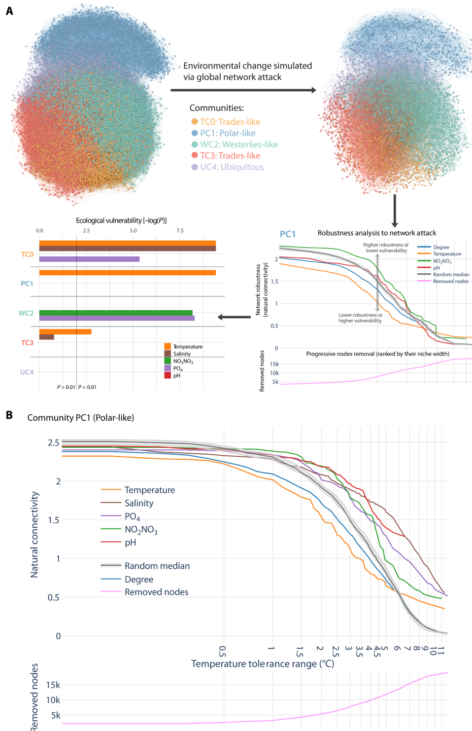
Fig. 3. Predicting ecological vulnerabilities via network-based simulations. (A) Environmental change simulations are performed through tolerance range perturbations, which is progressively removing nodes of the GPI ranked by their environmental niche width (from smaller to larger), to predict ecological vulnerabilities of GPI communities. Significant vulnerabilities to environmental changes were determined by comparing distributions of the network natural connectivity (a graph robustness measure) evolution for each abiotic factor, as compared to a random perturbation. The ecological vulnerability of each GPI community was then quantified by the statistical significance [-log(P)]. GPI communities TC0, TC3 (Trades-like), and PC1 (Polar) were predicted vulnerable to temperature change, while community WC2 (Westerlies-like) was predicted vulnerable to nutrient concentration variations. (B) The polar community (PC1) is predicted to be particularly vulnerable to temperature variations (Wilcoxon rank test, P = 3.8 \times 10^{-10} ).