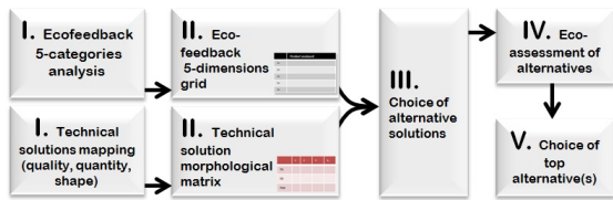
Figure 4: Eco-feedback Design Method, EcoDeM

This method supports the eco-feedback design by focusing on its performance, rather than on the performance of the product. It adds important information to the design process and, by means of the EcoFF, provides a simplified yet useful approach.