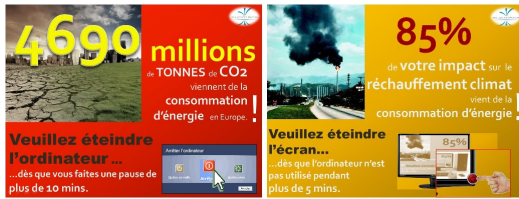
Figure 1: Messages sent in public computer experimentation.

The observation was aimed not so much to achieve an actual dramatical change in behaviour, but to understand the perception of the students. They were not briefed before the messages and they were not told they would be observed specifically to check if the messages were obeyed or not. The idea was to verify if the students would react by inner motivation.