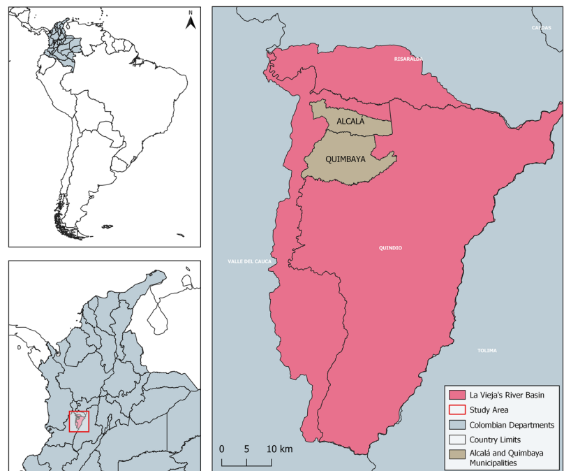
Fig. 3 The study area

In this context, it took 12 field trips (every 2 months) to identify and determine the types of frugivorous bats present in two farms’ agroecosystems regarding the ELI and MC productive