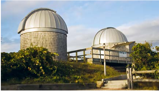
Fig. 2. Buildings of the Maria Mitchell Liones Observatory on Nantucket Island, Massachusetts