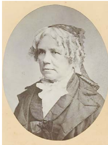
Figure 1. Maria Mitchell's portrait

Maria Mitchell was also curious and her researches spread between very diverse topics. The famous Miss Mitchell's comet [1] is nowadays known as a non-periodic comet with a hyperbolic orbit. In addition to Venus that she focused on as a human computer, she observed for a long time Jupiter satellites ([3], in which she refers to Io, Europe, Ganymede, and Callisto as numbers, as the norm back then required) and Saturn satellites ([4], where she explicitly names Tethys, Dione, Rhea, Encelade, and Titan). Maria Mitchell also focused on the Sun and suggested that solar patterns could be due to surface irregularities like holes instead of clouds. Eventually, she observed several double stars, thoroughly reporting her coordinates and characteristics [5].