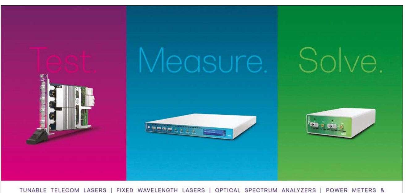
TUNABLE TELECOM LASERS | FIXED WAVELENGTH LASERS | OPTICAL SPECTRUM ANALYZERS | POWER METERS & ATTENUATORS | SWITCHES & POLARIZATION CONDITIONERS | PPGS & BERTS | COHERENT OPTICAL COMMUNICATION TX/RX

intensity varies). Moreover, a phylogenetic analysis in algae indicates that the gene encoding FAP was mostly conserved during evolution of algal lineages but was always absent when the photosynthetic capacity was lost. Hypotheses about the role of hydrocarbons produced by FAP in photosynthetic membranes include the regulation of the overall fluidity of the membranes in response to specific conditions of light and temperature, a role in the association/dissociation between specific proteins of the photosynthetic apparatus or the action as a chemical signal in membranes.