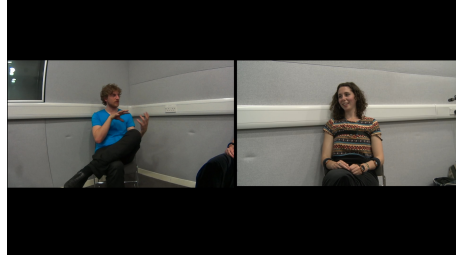
Fig. 1: Both Speakers During A Dialogue