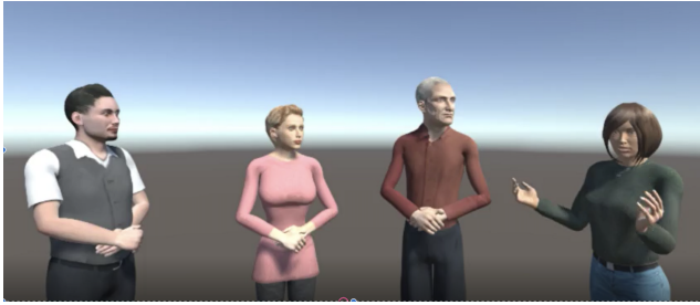
Figure 2: Screenshot of the interaction

agents. Additionally, we changed the gaze pattern of the agents when speaking to the user to gaze at the user 3 .