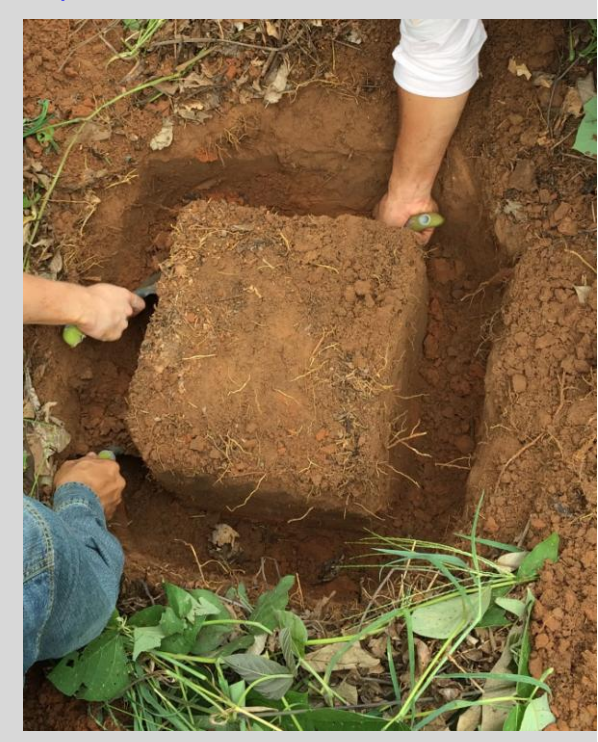
NGOs, Environnemental Engineering 361

Biofunctool® indicators evaluate in situ of soil the quality through measuring of the functions driven by soil biotic activities (respiration, nutrient cycling, carbon sequestration, soil structure). These tools are meant to be financially accessible and easy-to-use, not requiring a high level of expertise. Biofunctool® helps to promote agroecological practices and arouses growing interest from many users (Research and Technical Institutes, organisations, 360 Public agricultural