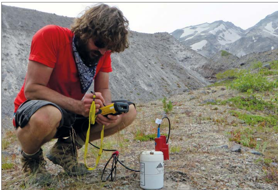
1 Small, cheap and remarkably useful: modern high-frequency seismic nodes are increasingly popular for deployments in remote areas and novel seismological situations.

In 1883, John Milne postulated that earthquake energy could be recorded at great distances (Milne 1883). This was proven in 1889 when a recording of a teleseismic earthquake (from Japan) was made by Ernst Von Rebeur-Paschwitz on a seismometer in Potsdam, Germany (Von Rebeur-Paschwitz 1889). Von Rebeur-Paschwitz soon realized that a set of seismometers deployed at stations globally could enhance