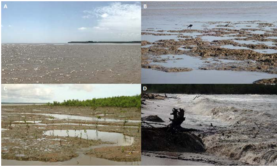
Fig. 1. – French Guiana mangroves dynamics driven by the alternate phases of accretion and erosion linked to the Amazonian dispersal system. A: From bottom to top: overall view of the transition between turbid waters, mud bank and mature Avicennia germinans mangrove forest (Kourou coast). B: Consolidated mud bank (Awala beach). C: Pioneer and young mangrove forest of A. germinans (Sinnamary estuary). D: Erosion and destruction phase of mangrove forest (Mana paddy field area).