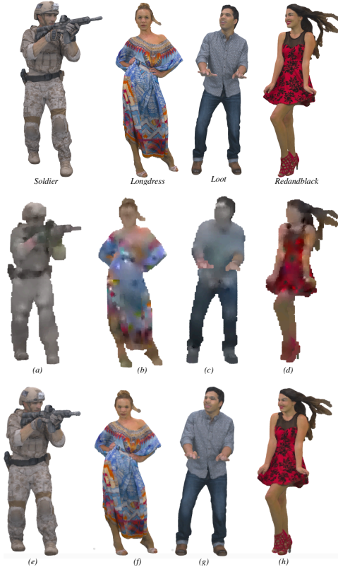
Fig. 2. Rendering results for original point clouds (first row), compressed point clouds using MPEG lossy PCC (second row): (a), (b), (c), (d) and using our optimized TSPLVQ (third row): (e), (f) (g), (h).

cloud requiring therefore a post-processing. For instance, for the Soldier point cloud, the MPEG reference model cannot show details in the complex and smooth regions inducing a great loss of visual details (see Fig. 2 (a), (b), (c), (d)) while with our method using a lower bitrate for the leaves (0.0002 bpov), reasonable quality was achieved on all point clouds, as shown in 2(e), (f), (g), (h). Hence, the optimized method can preserve the details and the global look of the original point cloud.