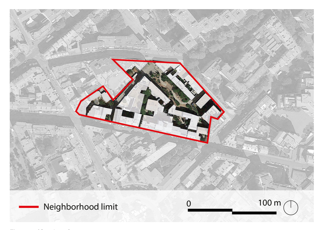
Figure 1: (Continued).

Both DSG and Fréquel represent urban redevelopment projects that sit on brownfield at the edge of their city, offering the possibility of bringing land characterized as waste following urban deindustrialization back into productive value generation. In DSG, a pre-existing industrial use as a ship-building site meant that extensive environmental remediation was required. The site was uninhabited at the time of redevelopment but sits on unceded Coast Salish land in the traditional territories of the Songhees (Lekwungen) First Nation, who were displaced to the Songhees Point reserve before the onset of industrial development. In the case of Fréquel, this site within the ancient village of Charonne in the outermost arrondissement of Paris also had a former industrial use as a photographic film development factory. Its pre-Hausmannian buildings were dilapidated but inhabited by working and subsistence class people, artists and artisans.