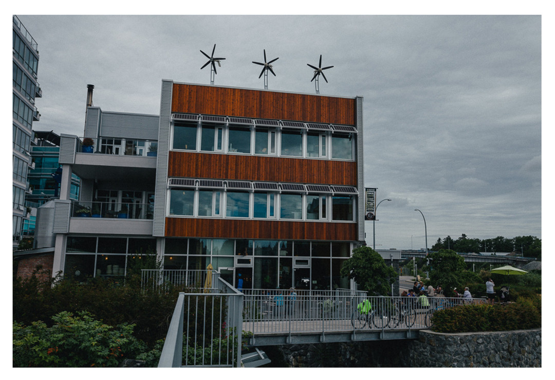
Figure 2: Café-led neighbourhood development, showing Caffe Fantastico at Dockside Green (above) and SuperCafé at Fréquel-Fontarabie (below).

to undertake extensive environmental remediation and follow this up with a new urban development that would be a model of environmental sustainability. Private development firm Windmill West, led by Joe van Belleghem, offered experience and confidence in environmental remediation; a very persuasive component of the company's value proposition for DSG.