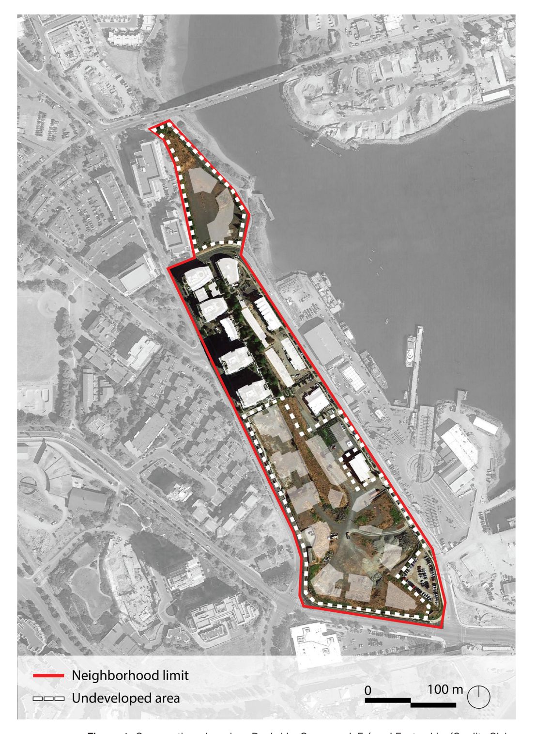
Figure 1: Comparative plan view Dockside Green and Fréquel-Fontarable (Credit: Claire Doussard).

frameworks for urban design and development, there is no real possibility that either project was influenced by the other. These are independent cases of attempts to define and model a new idea of a sustainable urban neighbourhood.