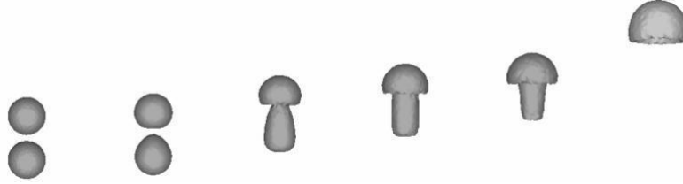
FIGURE 2 – Isovalue zero of the level set function for bubble coalescence

In this three dimensional example, the domain \Omega = [0.01; 0.01; 0.02] with two bubbles initially located, respectively, at (0.005; 0.005; 0.005) and (0.005; 0.005; 0.00797) , are considered. The bubbles have an initial diameter equal to D = 2.6 \text{ mm} . The aim of this multi-phase flow is to simulate bubble coalescence. The surface tension coefficient is 5.8 \times 10^{-4} \text{ N.m}^{-1} and the gravity is g = -8.65 \text{ m.s}^{-2} . The physical parameter for the surrounding fluid are \rho_1 = 880 \text{ kg.m}^{-3} and \mu_1 = 0.0125 \text{ N.s.m}^{-2} , for the bubble \rho_1 = 440 \text{ kg.m}^{-3} and \mu_1 = 0.00625 \text{ N.s.m}^{-2} . As time progresses, the lower bubble is deformed and the upper bubble shape changes from a sphere to a cap shape (figure 2 at times t = 0 \text{ s} , t = 0.015 \text{ s} , t = 0.045 \text{ s} , t = 0.06 \text{ s} , t = 0.075 \text{ s} , and t = 0.15 \text{ s} ). The average mesh size is 0.0003 \text{ m} . It can be noted that at time equal to 0.15 \text{ s} , the two bubbles merge together to become a single bubble with a cap shape. Our results are in good agreement with those found by [13].