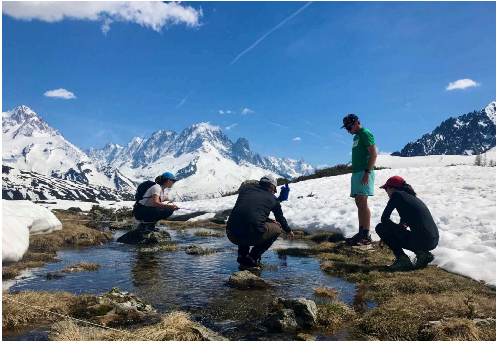
Figure 2: Students in the middle of scientific observations