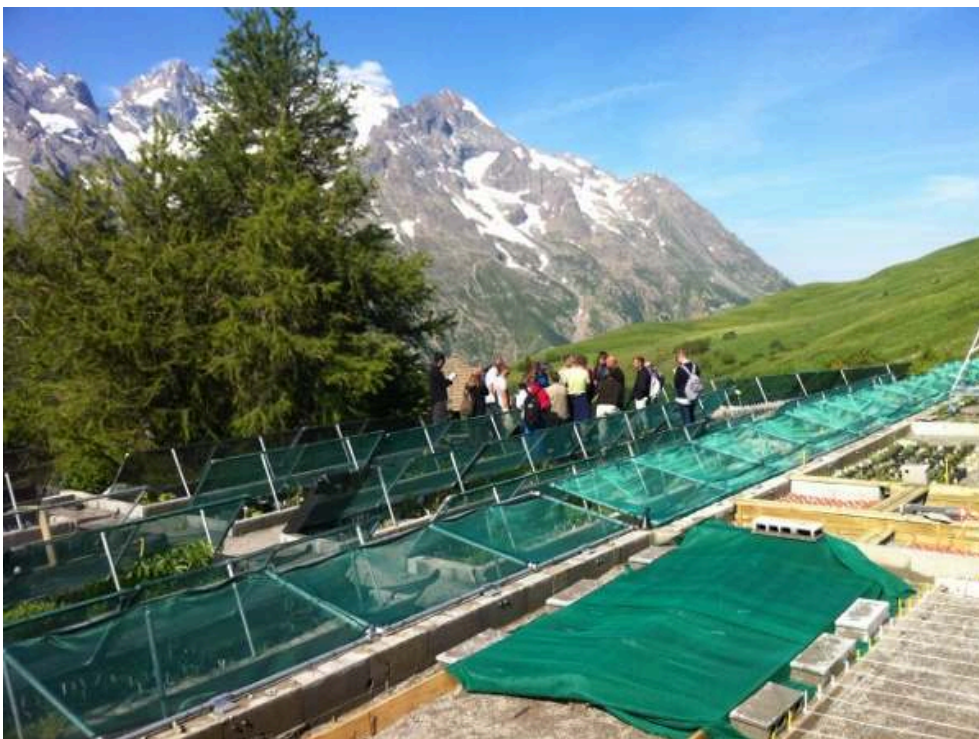
Illustration 1: A visit to the Jardin du Lautaret and its scientific facilities