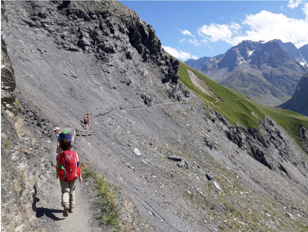
Illustration 3: An Immersion in the Écrins, the terrain of the Sentinel Shelters program