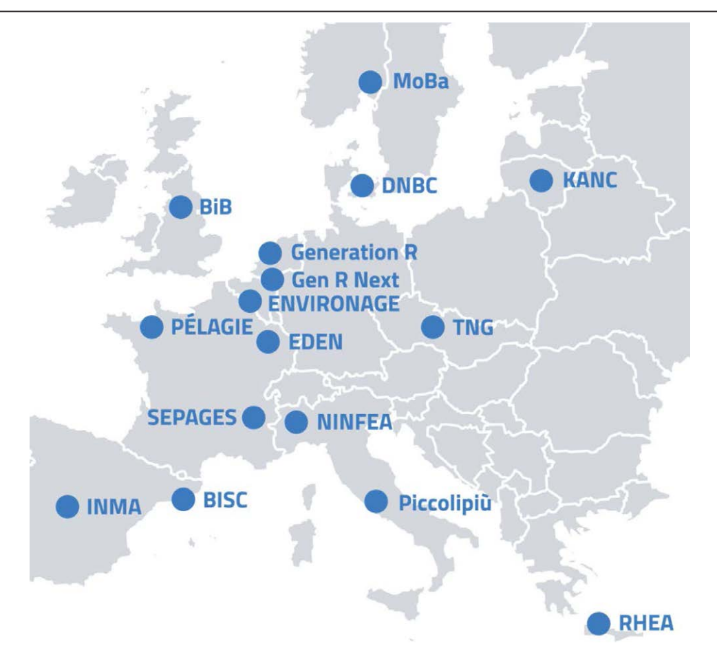
Figure 2. Cohorts participating in ATHLETE. BiSC indicates Barcelona Life Study Cohort; DNBC, Danish National Birth Cohort; EDEN, Etude des Determinants pre et postnatals du developpement et de la sante de l'Enfant; ENVIRONAGE, environmental influence on early ageing; INMA, INfancia y Medio Ambiente; KANC, Kaunas Cohort; MoBa, Norwegian Mother and Child Cohort Study; NINFEA, Nascita e Infanzia: gli Effetti dell'Ambiente; PELAGIE, Perturbateurs Endocriniens: Étude Longitudinale sur les Anomalies de la Grossesse, l'Infertilité et l'Enfance; RHEA, Crete Mother Child Cohort; SEPAGES, Suivi de l'Exposition à la Pollution Atmosphérique durant la Grossesse et Effets sur la Santé; TNG, CELSPAC The Next Generation cohort.

recently established, state-of-the-art birth cohorts that are highly suitable for exposome research: Suivi de l'Exposition à la Pollution Atmosphérique durant la Grossesse et Effets sur la Santé (SEPAGES) in France,59 environmental influence on early ageing (ENVIRONAGE) in Belgium,60 Generation R Next in the Netherlands, Barcelona Life Study Cohort (BiSC) in Spain (https://www.projectebisc.org), Piccolipiù in Italy,61 and CELSPAC-The Next Generation (TNG) in the Czech Republic. The inclusion of new cohorts is important for (1) their improved sampling strategies for exposure assessment, in particular the collection of many repeated urine samples during pregnancy (BiSC and SEPAGES), personal monitoring (BiSC and SEPAGES), and placenta sampling (BiSC, SEPAGES, ENVIRONAGE) and (2) their cutting-edge outcome assessments, including imaging techniques, to study organ and placenta development (BiSC, Generation R Next). The inclusion of new exposome cohorts also allows the evaluation of new chemicals that are now produced in high volumes but that are not detectable in biosamples collected during pregnancy in older cohorts even 10 years ago (e.g., new bisphenols).