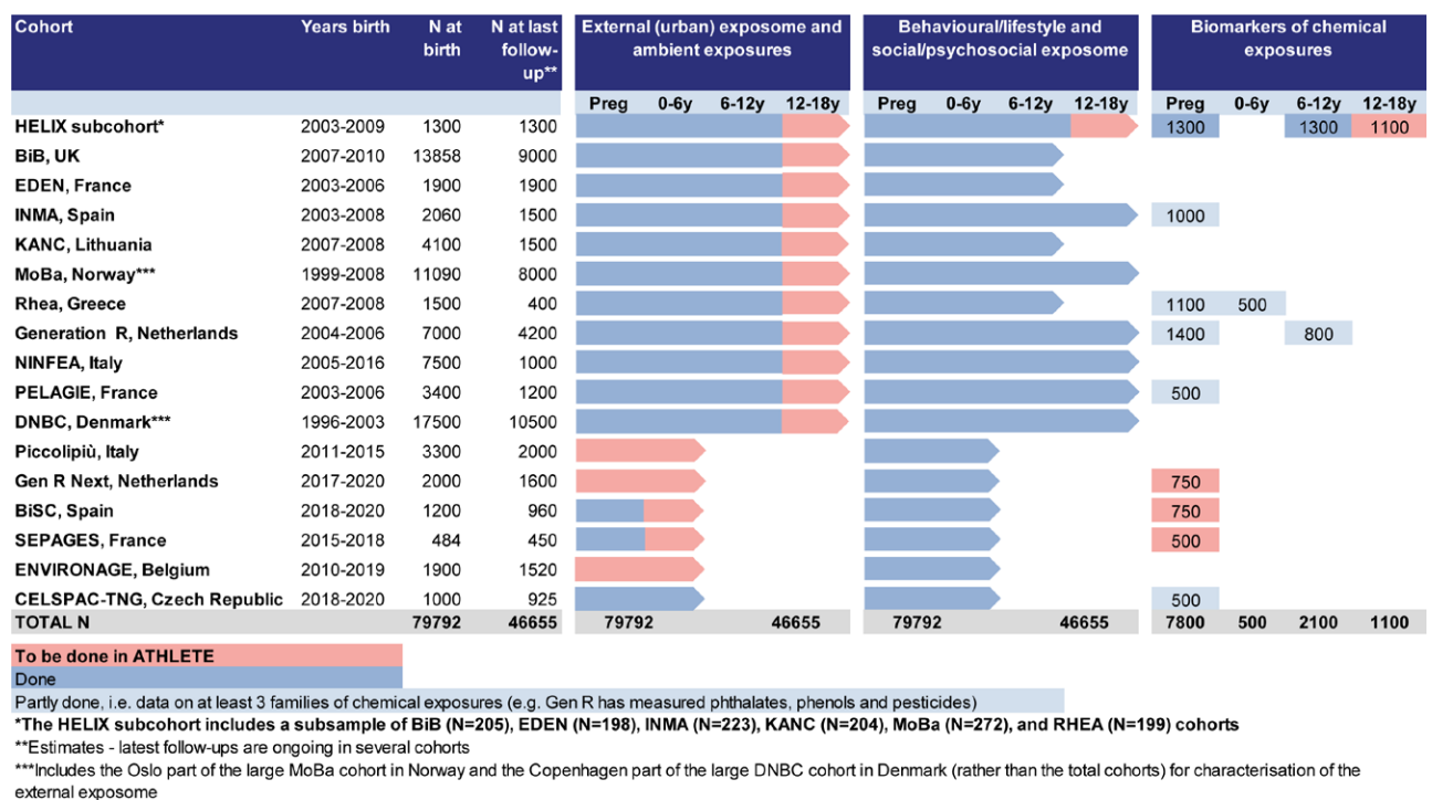
Figure 3. Timeline of available data on exposome domains in the ATHLETE cohorts. BiSC indicates Barcelona Life Study Cohort; CELSPAC-TNG, CELSPAC The Next Generation cohort; DNBC, Danish National Birth Cohort; EDEN, Etude des Determinants pre et postnataux du developpement et de la sante de l'Enfant; ENVIRONAGE, environmental influence on early ageing; HELIX, Human Early Life Exposome; INMA, Infancia y Medio Ambiente; KANC, Kaunas Cohort; MoBa, Norwegian Mother and Child Cohort Study; NINFEA, Nascita e Infanzia: gli Effetti dell'Ambiente; PELAGIE, Perturbateurs Endocriens: Étude Longitudinale sur les Anomalies de la Grossesse, l'Infertilité et l'Enfance; RHEA, Crete Mother Child Cohort; SEPAGES, Suivi de l'Exposition à la Pollution Atmosphérique durant la Grossesse et Effets sur la Santé.

cohort data. Each cohort will harmonize and store their own harmonized data on secure local servers and make the metadata findable through the data catalog.