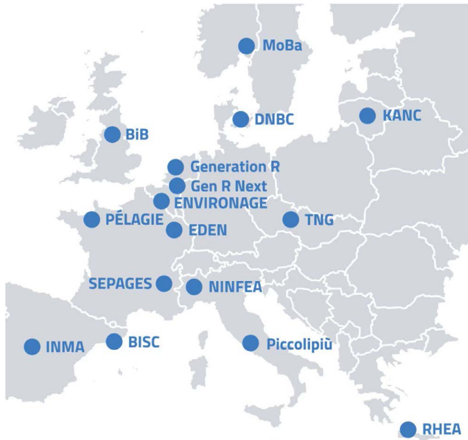
Figure 2. Cohorts participating in ATHLETE. BiSC indicates Barcelona Life Study Cohort; DNBC, Danish National Birth Cohort; EDEN, Etude des Determinants pre et postnataux du developpement et de la sante de l'Enfant; ENVIRONAGE, environmental influence on early ageing; INMA, Infancia y Medio Ambiente; KANC, Kaunas Cohort; MoBa, Norwegian Mother and Child Cohort Study; NINFEA, Nascita e Infanzia: gli Effetti dell'Ambiente; PELAGIE, Perturbateurs Endocriniens: Étude Longitudinale sur les Anomalies de la Grossesse, l'Infertilité et l'Enfance; RHEA, Crete Mother Child Cohort; SEPAGES, Suivi de l'Exposition à la Pollution Atmosphérique durant la Grossesse et Effets sur la Santé; TNG, CELSPAC The Next Generation cohort.

recently established, state-of-the-art birth cohorts that are highly suitable for exposome research: Suivi de l'Exposition à la Pollution Atmosphérique durant la Grossesse et Effets sur la Santé (SEPAGES) in France, 59 environmental influence on early ageing (ENVIRONAGE) in Belgium, 60 Generation R Next in the Netherlands, Barcelona Life Study Cohort (BiSC) in Spain ( https://www.projectebisc.org ), Piccolipiù in Italy, 61 and CELSPAC-The Next Generation (TNG) in the Czech Republic. The inclusion of new cohorts is important for (1) their improved sampling strategies for exposure assessment, in particular the collection of many repeated urine samples during pregnancy (BiSC and SEPAGES), personal monitoring (BiSC and SEPAGES), and placenta sampling (BiSC, SEPAGES, ENVIRONAGE) and (2) their cutting-edge outcome assessments, including imaging techniques, to study organ and placenta development (BiSC, Generation R Next). The inclusion of new exposome cohorts also allows the evaluation of new chemicals that are now produced in high volumes but that are not detectable in biosamples collected during pregnancy in older cohorts even 10 years ago (e.g., new bisphenols).