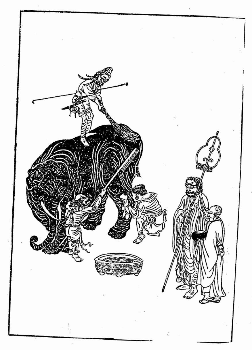
III. 7: Gushi Huapu, facsimile, Beijing, Wenwu chubanshe, 1983