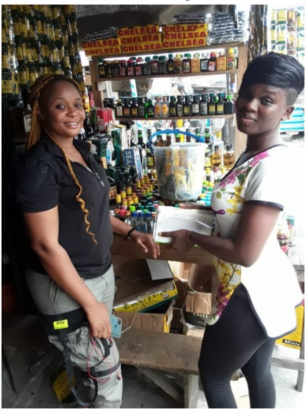
Plate 3: The researcher and a seller inside Sangotedo market

The findings of this study concur with an earlier study<sup>29</sup> that ascertains that alcohol business is perhaps among the most profitable businesses among women. To set up an alcohol business is lucrative, combine with the high level of demand for alcohol, these are primary factors that encouraged many sellers to establish the business. Since the aim of all business is profit making, alcohol business is regarded as a major profit-making machine among the women. Similarly, this study also observed that alcohol business in Lagos State was one of the most lucrative and easy to establish business among women before the lockdown.