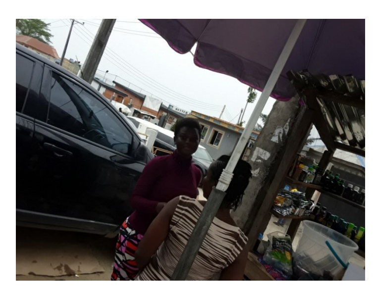
Plate 2: The Researcher and a seller turning her back at the camera