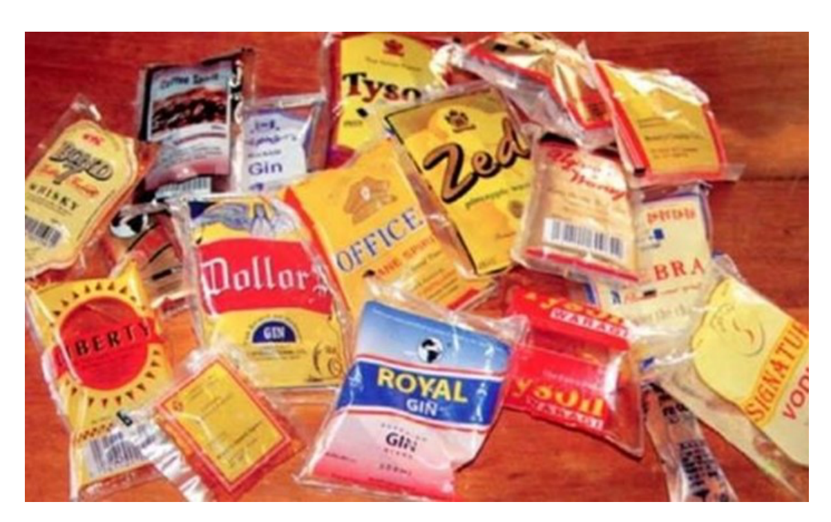
Plate 5: Image of Pelebe (sachet spirit)

High number of respondents approved and certified the usage of alcohol as one of the most effective measures against Covid-19.