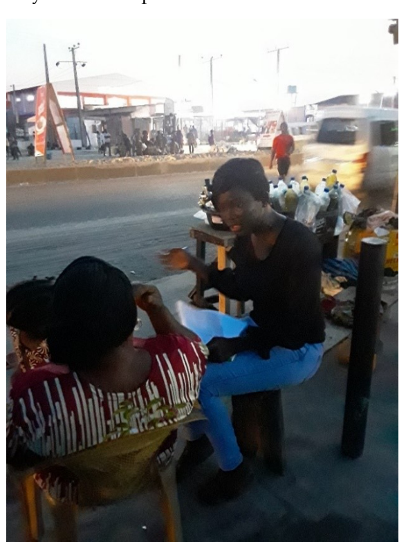
Plate 6: The researcher with the seller at Ogidan junction

My customers increased because big boys in this area who prefers to drink in bars and clubs started patronizing me. They even buy more, especially the bottle spirit. ^{36}