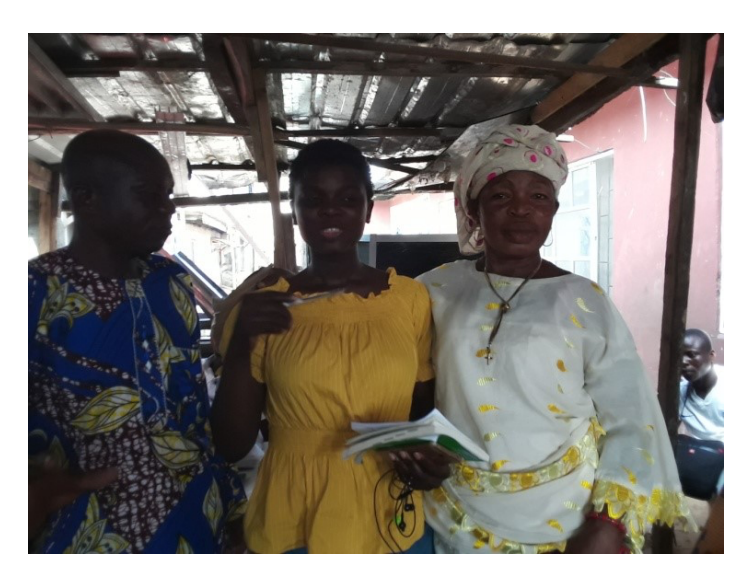
Plate 1: The Researcher and Union Leader and Secretary at the first meeting with the alcohol seller Union Members at Ibeju-Lekki

Approval for this study was given by the alcohol seller's Union Leaders after the objectives and significant of this study was discussed. The researcher later visited the Participants for this study in their shops, cabins and roadside kiosks at Eti Osa and Ibeju Lekki Local government, Lagos and also attended their weekly meetings where they had most of the focus group discussion. Interviews were conducted in Yoruba and English language at different locations within the study areas. At the initial stage of this study, the respondents were reluctant to admit alcohol sales during lock down, there were fearful because they mistook the researcher for a detective or government spy. The fieldwork last from 22 October to 19 December, 2020<sup>4</sup>. The total numbers of participants were forty four (44), thirty three (33) women<sup>5</sup> and eleven (11) men but the researcher only documented thirty two (32) participants because some participants refused to give their details<sup>6</sup>. While some participants bluntly rejected voice recording and image capturing, few agreed to image capturing only from behind<sup>7</sup>.