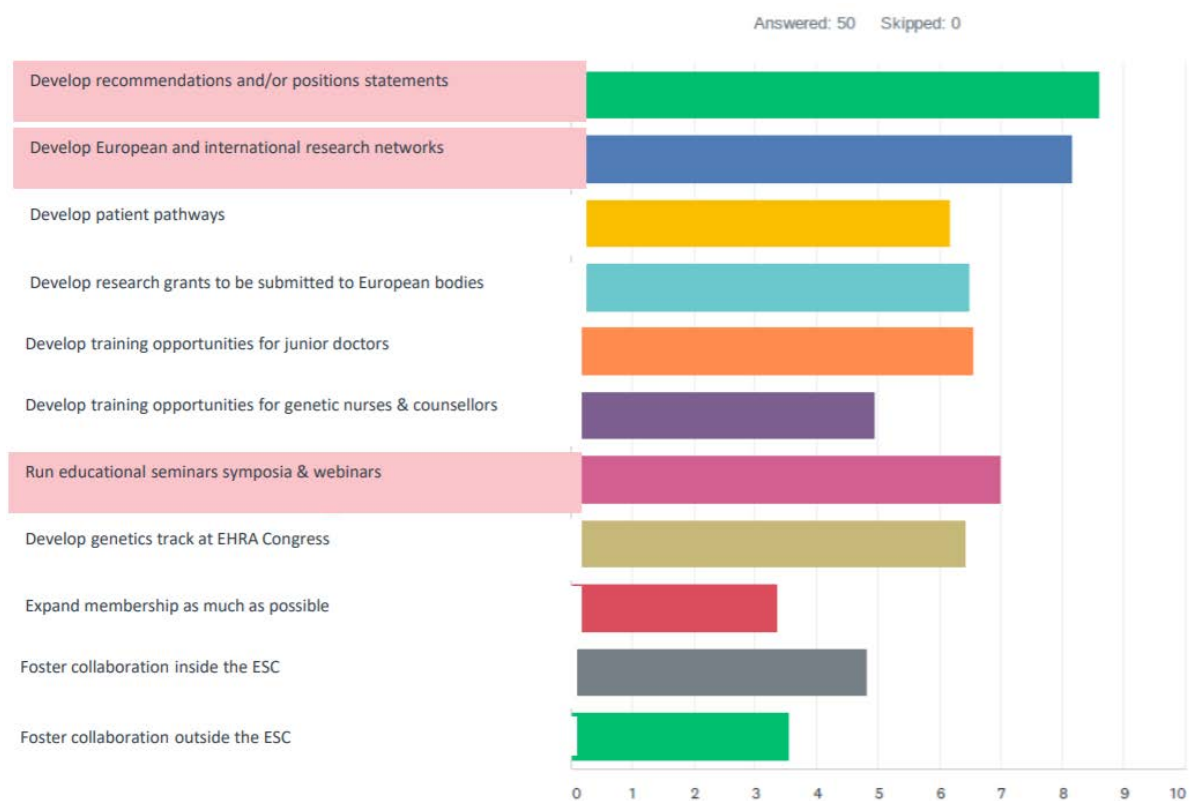
Figure 3. Results from the ECGen member survey (n=50 respondents) with the three preferred areas of activities indicated in pink.