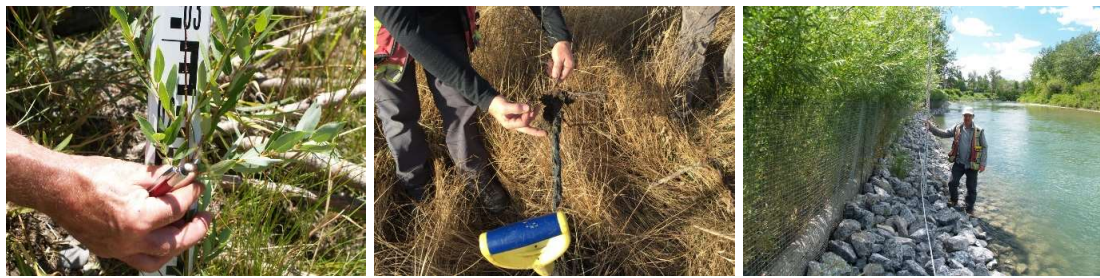
Figure 1: RMP Site Assessment photos